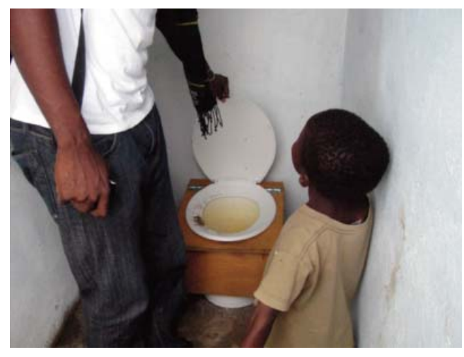
Figure 28 (left): Twenty liter receptacles provide smaller toilets for young children.

Figure 26 (above): The orphanage toilet is painted with a picture of the "human nutrient cycle" as well as a "GiveLove ecological sanitation" emblem. The rain water catchment system provides wash water for hands and toilet receptacles. GiveLove.org provided the setup and training for this self-managed compost sanitation system.