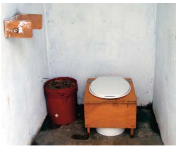
Figure 3: Toilet contents are covered inside the receptacle with sawdust and/or bagasse. The 20-liter receptacle simply lifts out when full.