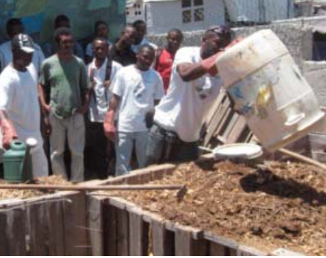
Figure 18: The rinse water is dumped into the pile.