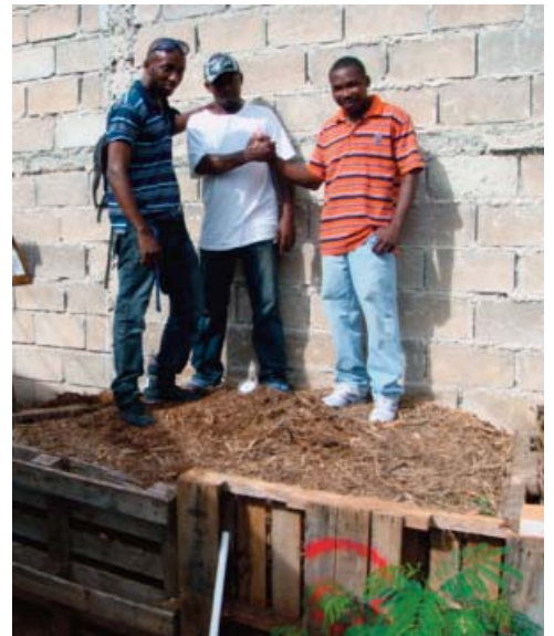
the heat from dissipating.

The bins can be located on bare soil with the base shaped into a slightly concave configuration, allowing any liquid to pool into the center of the bin, thereby preventing leaching out the bottom onto the soil surface should excess moisture be an issue. Sufficient dry material should be used in the biological