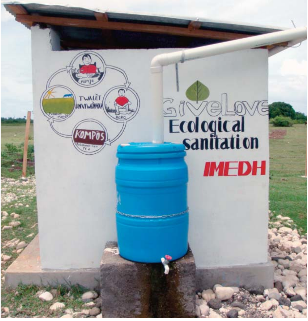
Figure 26 (above): The orphanage toilet is painted with a picture of the "human nutrient cycle" as well as a "GiveLove ecological sanitation" emblem. The rain water catchment system provides wash water for hands and toilet receptacles. GiveLove.org provided the setup and training for this self-managed compost sanitation system.

toilets are meant for the smaller children while the 60 liter toilets are meant for the bigger children and adults. The toilet receptacles are located inside the toilet stalls, which are inside a small building adorned with a painting of the "human nutrient cycle" (Figure 26). The receptacles are removed from the inside. The 20 liter receptacle lifts out while the 60 liter receptacle slides out. Figure 27 illustrates the 60 liter toilet and Figure 28 illustrates the 20 liter toilet.