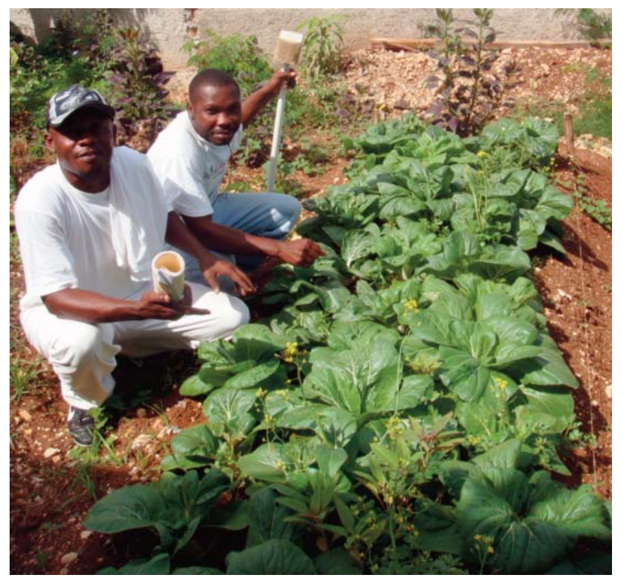
Figure 22: Mature compost is an excellent soil additive.