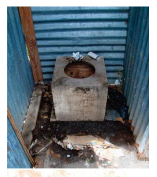
View down inside toilet seat.