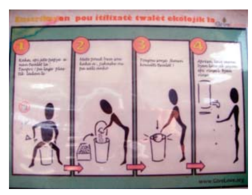
Figure 20: Posters describing the correct way to use the toilets are posted in every toilet stall.

There is no waste in this system. Instead, where other sanitation systems produce sewage and pollution, compost sanitation produces fertile soil and food for humanity (Figure 22).