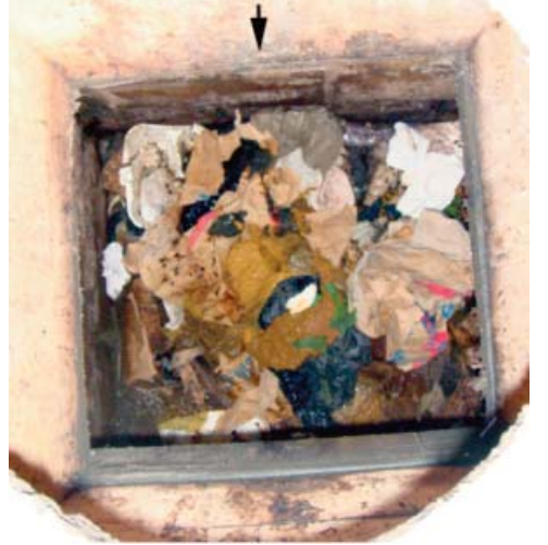
Figure 23: A typical Haitian pit latrine in Leogane at a Habitat for Humanity site is filthy and unpleasant. The toilet smells terrible, breeds maggots and flies, creates waste and pollutes ground water.

Many Haitians do not have the luxury of ecological sanitation systems and instead must use pit latrines. These are very odorous, fly infested, maggot-breeding holes in the ground which children can fall into. They're unpleasant to say the least, they pollute ground water, and the flies can spread disease. Figure 23 provides an example of a typical pit latrine in use at a Habitat for Humanity site in Leogane.