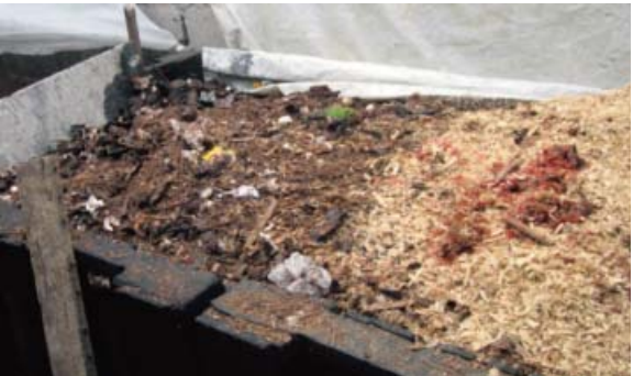
Figure 32: This compost is being mismanaged. There should be nothing visible but clean cover material on top. Instead, the compost was odorous and was breeding maggots. The few seconds it would have taken to throw clean cover material on the pile would have eliminated the odors and maggots.

Figure 32 shows a mismanaged compost pile at an American relief agency site in Port au Prince. Note that the compost pile has inadequate cover material on top. There should