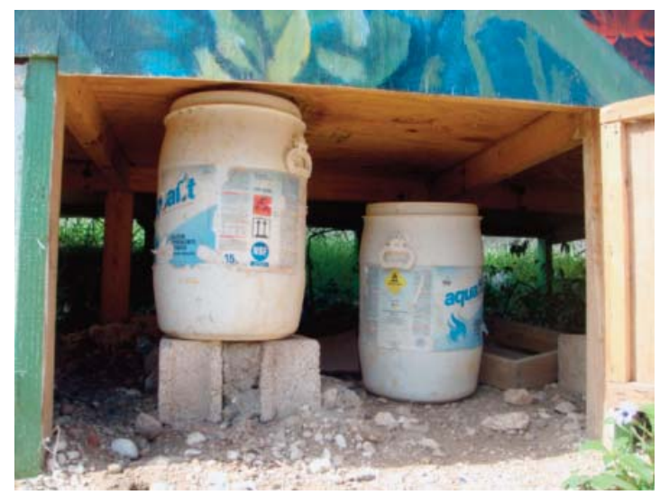
Figure 9 (above): 60 liter receptacles slide out from underneath the toilet stalls.