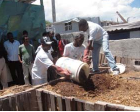
Figure 15: The toilet material is emptied into the pile.