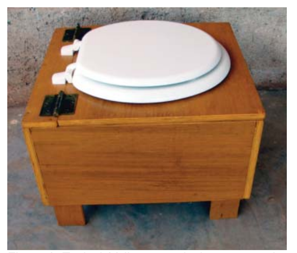
Figure 2: Typical 20 liter capacity humanure toilet in Haiti made from plywood construction.

Availability of appropriate cover material is essential to the successful operation of a compost sanitation system. The cover material must not be too coarse. Wood chunks, for example, are inappropriate — even wood shavings are not ideal for use inside the toilets if they are airy and can allow odor to escape. Wood shavings can inhibit thermophilic composting because