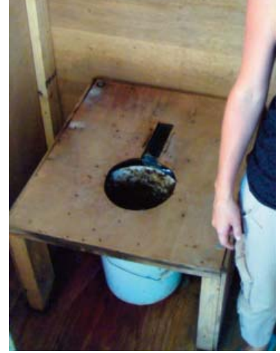
Figure 1: A "bucket toilet" uses no cover material, is very odorous, breeds flies and pollutes the environment. This fecescaked bucket in Port au Prince is an example of unacceptable sanitation.

The purpose of the toilet is to collect feces, urine, toilet paper, and sawdust (or other cover material) so as to prevent unsanitary contact with the environment. The collection of toilet materials in this manner primes the human excrement for thermophilic composting because it is combined with a carbon-based organic material inside the toilet. Human excrement will not compost on its own because it's too wet and too high in nitrogen. By