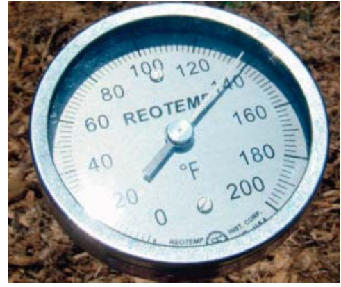
Figure 11: Temperatures measured ranged from 46C (115F) to over 74C (165F). Fluctuations varied according to size of pile, age and contents.

The self-managed compost sanitation system has a dedicated crew of three persons: one woman who cleans the compost receptacles and two men who manage the composting (Figure 13). They are paid by the school. In Figure 13, the nearer bin has reached maturity and is being used in the gardens. The far bin has been aging for 6 months and is still at approximately 55C. It will require months more to cool down and reach maturity.