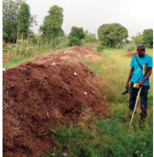
Figure 6: Compost windrows have large surface to volume ratios. The surfaces remain cool and the piles must be stirred regularly to subject all parts of the compost matrix to the hot internal temperatures.