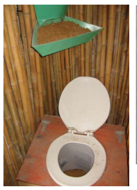
Figure 30 (right): Sopudep uses 20 liter receptacles that lift out of the toilet when full. The bagasse is dispensed by hand from the green wall-mounted bin.