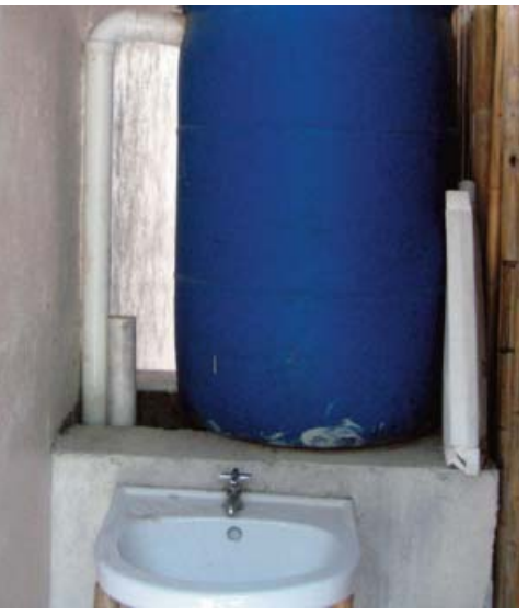
Figure 31 (above): Sopudep's toilet building includes a hand washing station supplied by rain water.