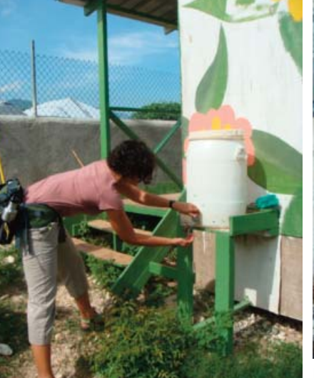
Figure 13: Two men manage the compost Figure 12: Hand washing stations are sanitation system at the Amurt School.

When toilet receptacles are full, the contents are deposited into a compost bin. First, the cover material in the bin is raked back, then a depression is dug into the top of the compost pile (Figure 14). The toilet material is added into the depression (Figure 15) and the cover material is raked back over the fresh deposit (Figure 16).