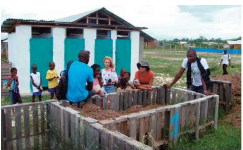
Figure 25: The toilets at the Matt Gunn orphanage site are located adjacent to the compost bins. There is no odor and no flies. A bagasse pile nearby provides the cover materials.